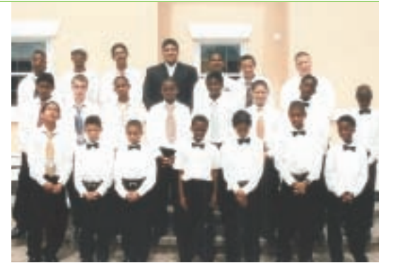
Members of De Boys Day Out Club