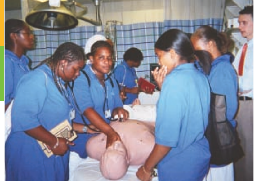
Bermudian Students in a lab at Massachusetts General Hospital