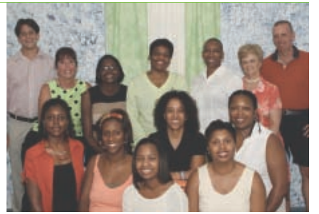
Staff at The Family Centre

Since 1999, The ACE Foundation has donated over half a million dollars to assist The Family Centre to deliver on its mission of providing families and young people in Bermuda with the tools they need to lead successful lives.